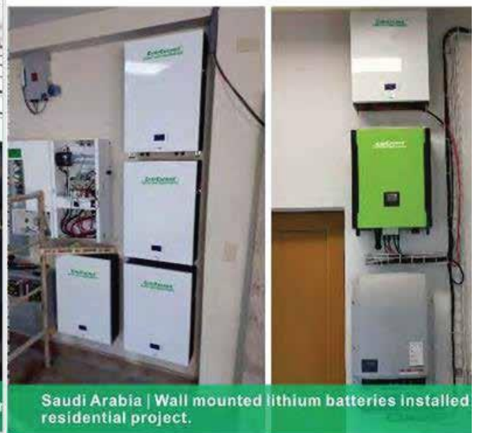
Saudi Arabia | Wall mounted lithium batteries installed residential project.