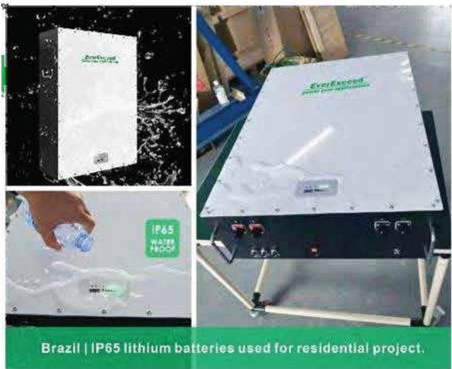
Brazil | IP65 lithium batteries used for residential project.