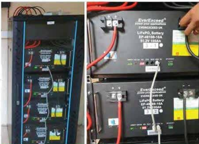
Thailand | EP-48100 batteries solar energy storage for school.