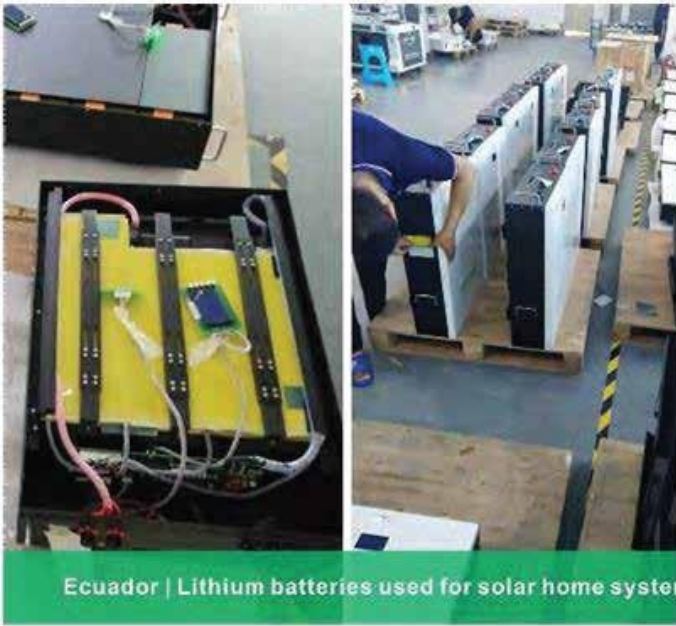
Ecuador | Lithium batteries used for solar home system