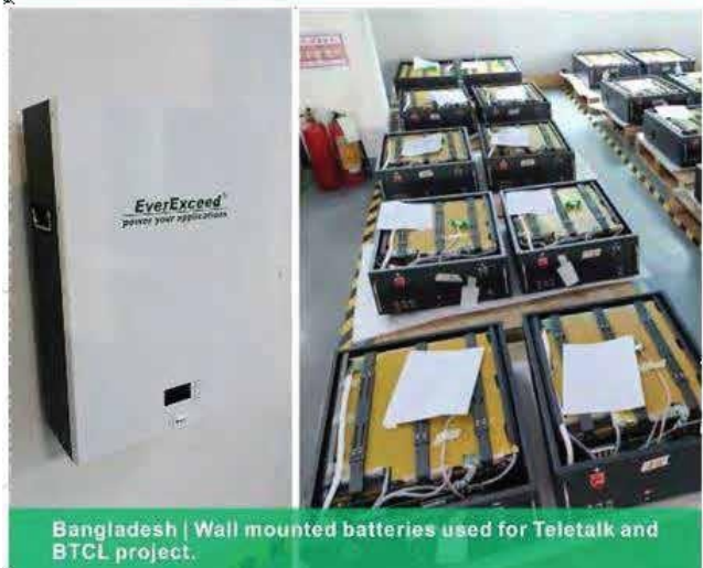
Bangladesh | Wall mounted batteries used for Teletalk and BTCL project.