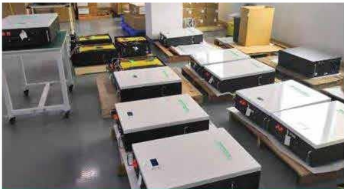
France | Wall mounted batteries used for residential and commercial project.