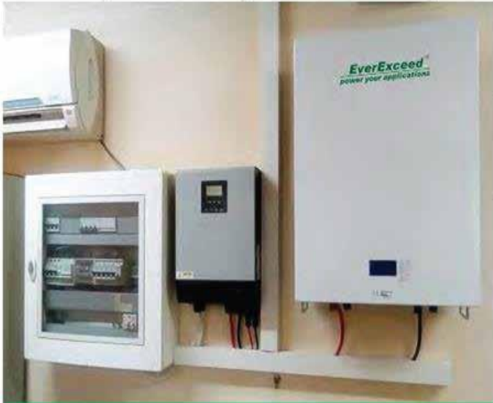
Oman | Wall mounted lithium batteries installed for residential project.