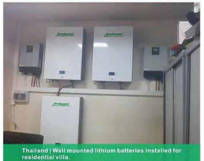
Thailand | Wall mounted lithium batteries installed for residential villa.