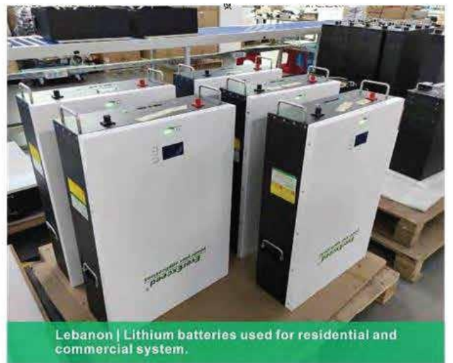
Lebanon | Lithium batteries used for residential and commercial system.