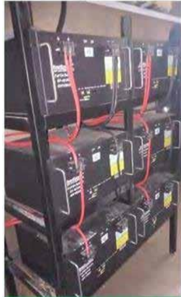
Kenya | EP-48100 batteries were installed for Kenya solar system project.