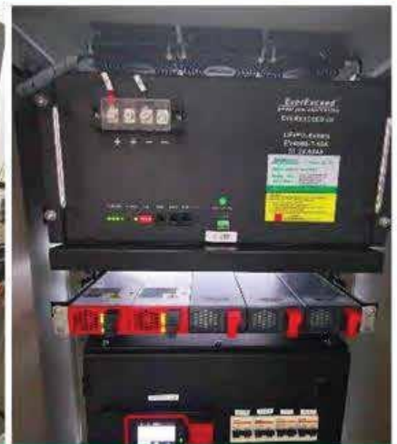
Thailand | EV-4860-T lithium batteries were installed for PEA project.