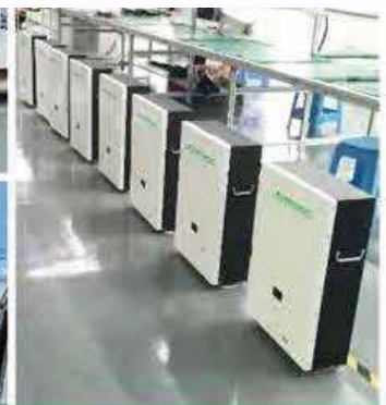
Bolivia | Wall mounted lithium batteries used for residential project.