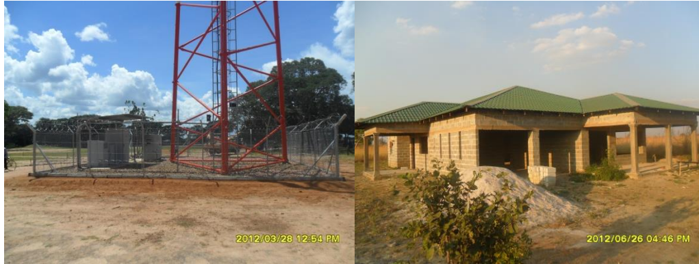
(Construction of Airtel Towers & Residential Houses)

The Company is also specialised in general construction and this involves construction of Houses, Schools, Towers and Automated Tailor Machines (ATM's).