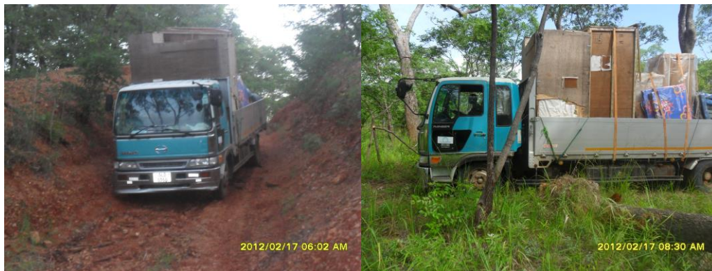
(Transportation of Generators to Mulilo)

Barium Services Limited is specialised in the Transportation of telecom equipment, office equipment, Microwave, A.T.Ms, which we have done with various organisations such as Airtel Zambia and First National Bank (FNB).