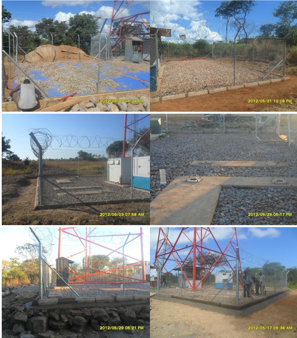
(Fence Extensions for Airtel Towers)